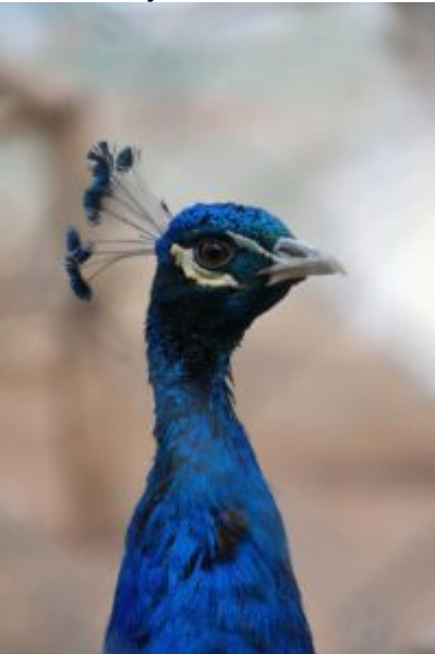
Tommy D New York

As TheNonProfitSectorConnector, Tommy D is always looking for opportunities to connect with others â?? A major boon of PALS is Tommy adopted Cheeto, a rescue puppy!